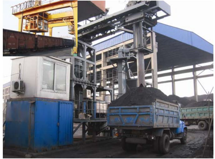
AUGER SAMPLING SYSTEM

Sweep Sampling Systems are an economical and simple tool to get samples of material from a moving conveyor belt. They can be installed on either horizontal or inclined conveyors. There are thousands of sweep samplers installed worldwide. It can be used as stand alone system or it can also be used as a primary sampler for a multiple stage sampling system.