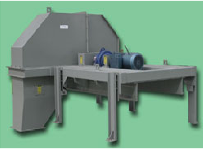
SWEEP SAMPLING SYSTEM