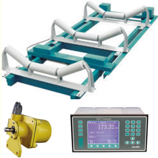
Model N-63 Belt Scale System

The Bulk Pro Systems Model N63 Belt Scale System is designed for industrial applications that run high speeds and require a precise accuracy of \pm 0.25\% . It can help you effectively manage your inventory, monitor production and control your product output. This belt scale system provides crucial information for the successful management and proficient operation of your plant.