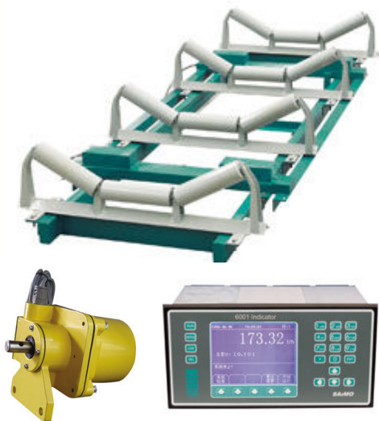
Model N-64 Belt Scale System