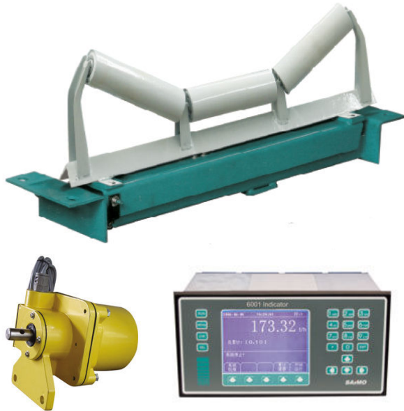
Model N-61 Belt Scale System